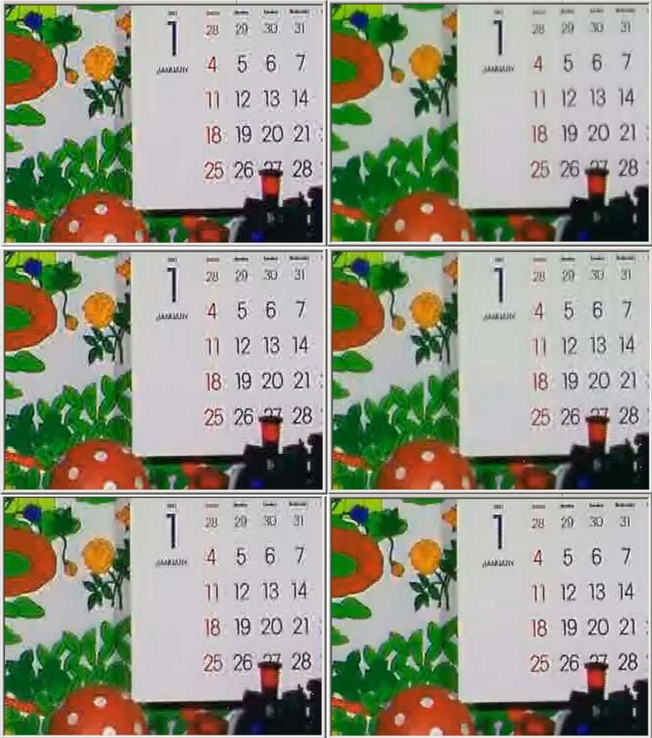
Figure 3. Subjective results from a portion of the Mobile sequence: (upper-left) decoded image, (upper-right) wavelet result, (middle-left) MPEG-4 result, (middle-right) POCS result, (lower-left) DCT result; (lower-right) proposed edge map result.