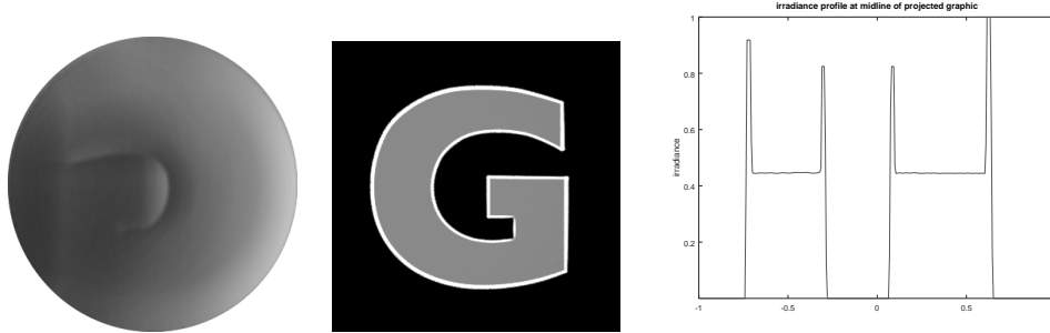
Figure 2. A freeform lens, a ray-traced simulation of its irradiance pattern, and an irradiance profile along a horizontal midline of the image, showing how the extended light source thickens the caustic at the figure/ground boundary.

Using the Cartesian coordinates in fig. 1, the refraction law can be written in cosine-vector form: