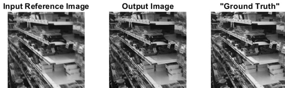
Figure 3: Total of 9 blurry inputs from UBC dataset, ran with 5 alternations and linearly decreasing rank parameter. Here are shown the input reference image (left), the output reference image (middle) and the ground truth (right).