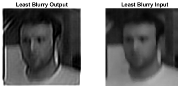
Figure 1: Total of 8 blurry input images of individual’s face, ran with 5 alternations. Here are shown the least blurry output and input (smallest \ell_1, \ell_2 norm ratio). Our methodology produces a sharper output, arguably better than the blurry input images and an improvement relative to our previous deblurring methodologies that use TV and TV2 regularization.

neighboring frames. These set of blurry images are then deblurred via our methodology.