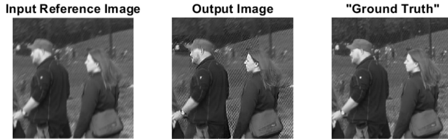
Figure 4: Total of 9 blurry inputs from UBC dataset, ran with 5 alternations and linearly decreasing rank parameter. Here are shown the input reference image (left), the output reference image (middle) and the ground truth (right).