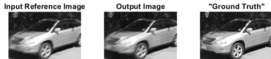
Figure 6: Total of 9 blurry inputs from UBC dataset, ran with 5 alternations and linearly decreasing rank parameter. Here are shown the input reference image (left), the output reference image (middle) and the ground truth (right).