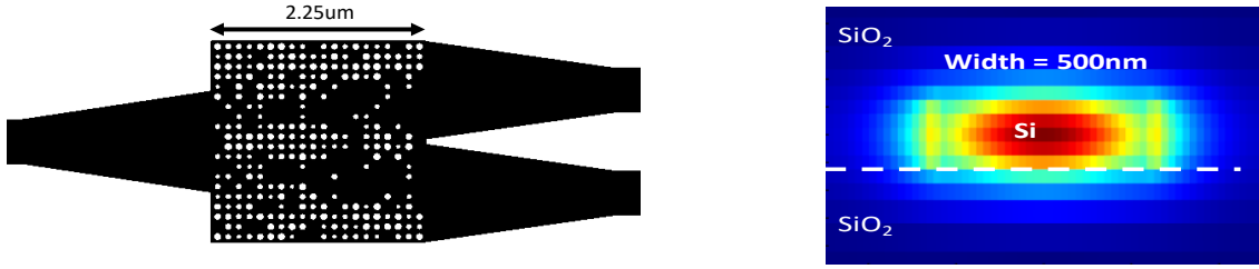
Figure 1. Power splitter footprint & cross-section of the input/output waveguide