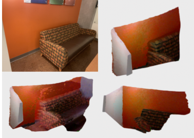
Fig. 1. Registration result of point clouds from 93 frames with our proposed framework using 3D points, 3D lines and 3D planes. The scene contains texture-poor areas, which are difficult for methods that rely on 2D features derived from color images.

Without good visual features in camera images, robots will have to rely on other sensing modalities to provide 3D measurements for registration and pose estimation. A popular modality is LIDAR, which can provide a 360° point cloud around the robot. However, LIDAR sensors are both expensive and, more importantly, heavy. In the case where the