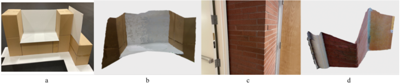
Fig. 3. Point cloud registration results for two environments. (a) Box Scene, (b) registered point clouds for Box Scene from 125 frames, (c) Hallway Scene, (d) registered point clouds for Hallway Scene from 59 frames.